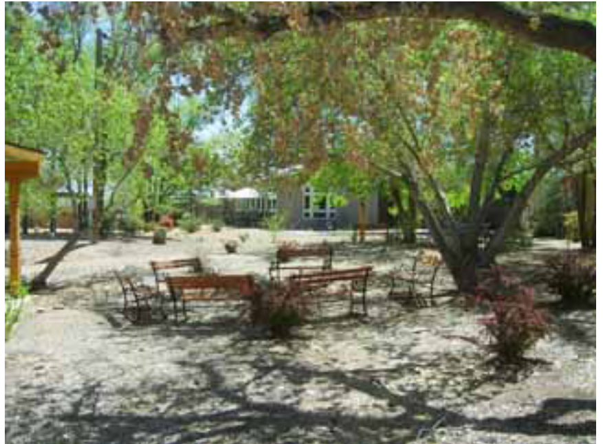
Grounds of the Bosque Center

A limited number of scholarships are available for seminar-