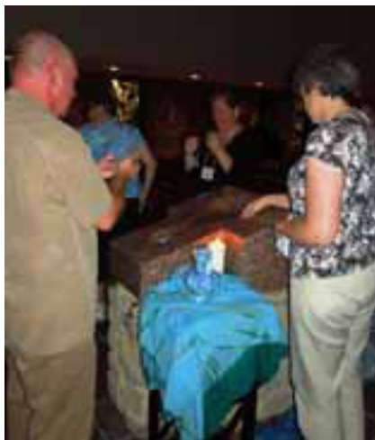
Gathering Around the Font