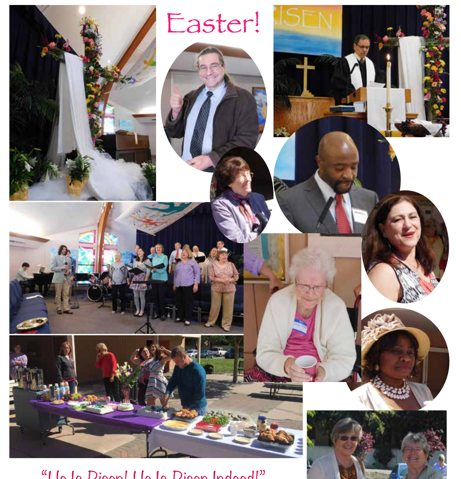
"He Is Risen! He Is Risen Indeed!"