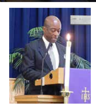
Seder (Maundy Thursday)