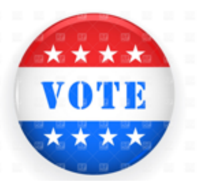
Election Day Tuesday, November 8