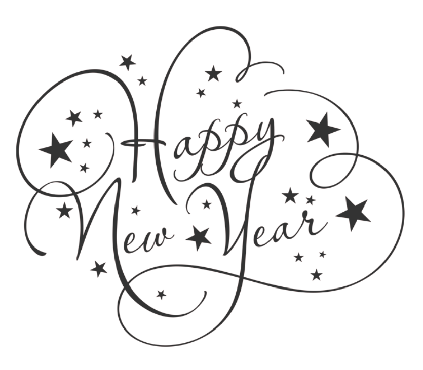
WAKE FOREST BAPTIST CHURCH

P.O. Box 7326, Winston-Salem, North Carolina 27109-7326 Church Office Phone: 336-245-8914 Pastor Phone: 336-414-3640 www.wakeforestbaptist.org