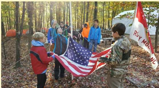
Raising the colors to start the day

Troop 7 recently camped at Hanging Rock State Park. The scouts hiked over 5 miles on Saturday uphill BOTH WAYS!! (At least that is the way I remember it!) The top of hanging rock gave us a beautiful view of the fall colors. Temperatures for this outing got down to 27 degrees, but we had prepared the scouts by teaching them to pack layers of clothing and how to prepare their sleeping gear from the ground up. Everyone did great as there was a fire ban and we could not have a camp fire. The scouts also prepared their menus for the weekend by cooking hamburgers and homemade fries, pizza and peach cobbler in the Dutch oven.