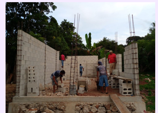
Block walls on rock foundations, steel columns