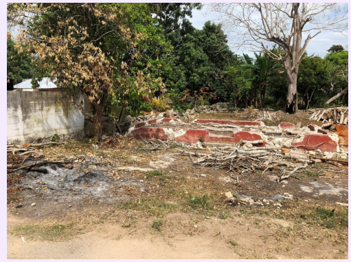
Demolishing the wooden structure (Palapa) and clearing the land for the structure.