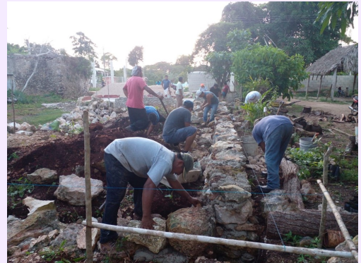
Building the Foundation