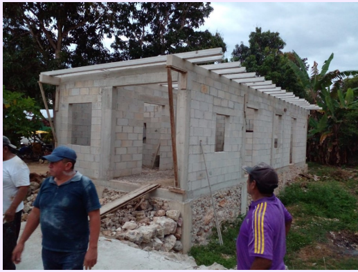
Concrete beam and block roof with steel reinforcement and concrete mixed on the ground and poured with 5 gallon buckets.