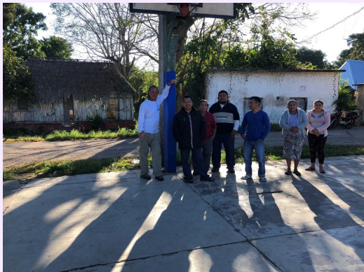
The villager Water Committee in front of a former school where the water treatment facility will be constructed.

Last Fall the Endowment Committee recommended, and Session approved fund distribution to a water purification project in a lowland Mayan Village in the central portion of the Yucatan Peninsula. Two faith-based, Presbyterian entities have been at work to bring this ambitious project closer to fruition. The two entities are: Tres M Ministerios, a consortium of Presbyterians from the Midwest, Southeast and Northeast working in collaboration to serve the needs of the Maya throughout the Yucatan peninsula; and Living Waters of the World, a Presbyterian, Synod based endeavor bringing clean water systems to places in need nationally and internationally. The photos below show the efforts of the villagers in Tabí at work to construct the structure that will house the Reverse Osmosis System that will purify water for distribution and sale for this and nearby villages. Cf page 23-26 of the 2021 Annual Report.