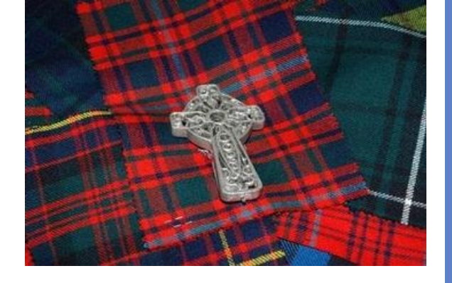
THIS SUNDAY , in celebration of Scottish Heritage Sunday we are using Scottish tunes and texts in worship. These include pieces by John Bell, minister of the Church of Scotland and driving creative force in the lona Community in Scotland.