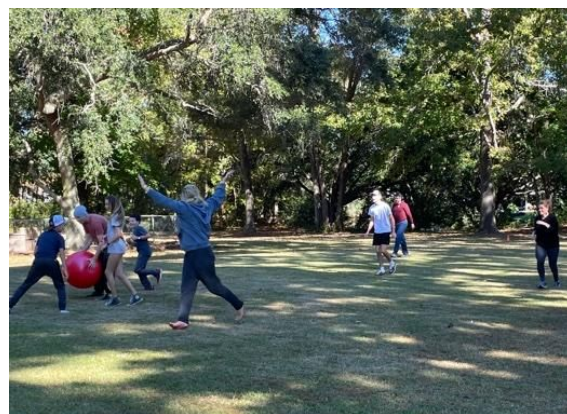
Youth Group enjoyed games in the Church Yard last week.