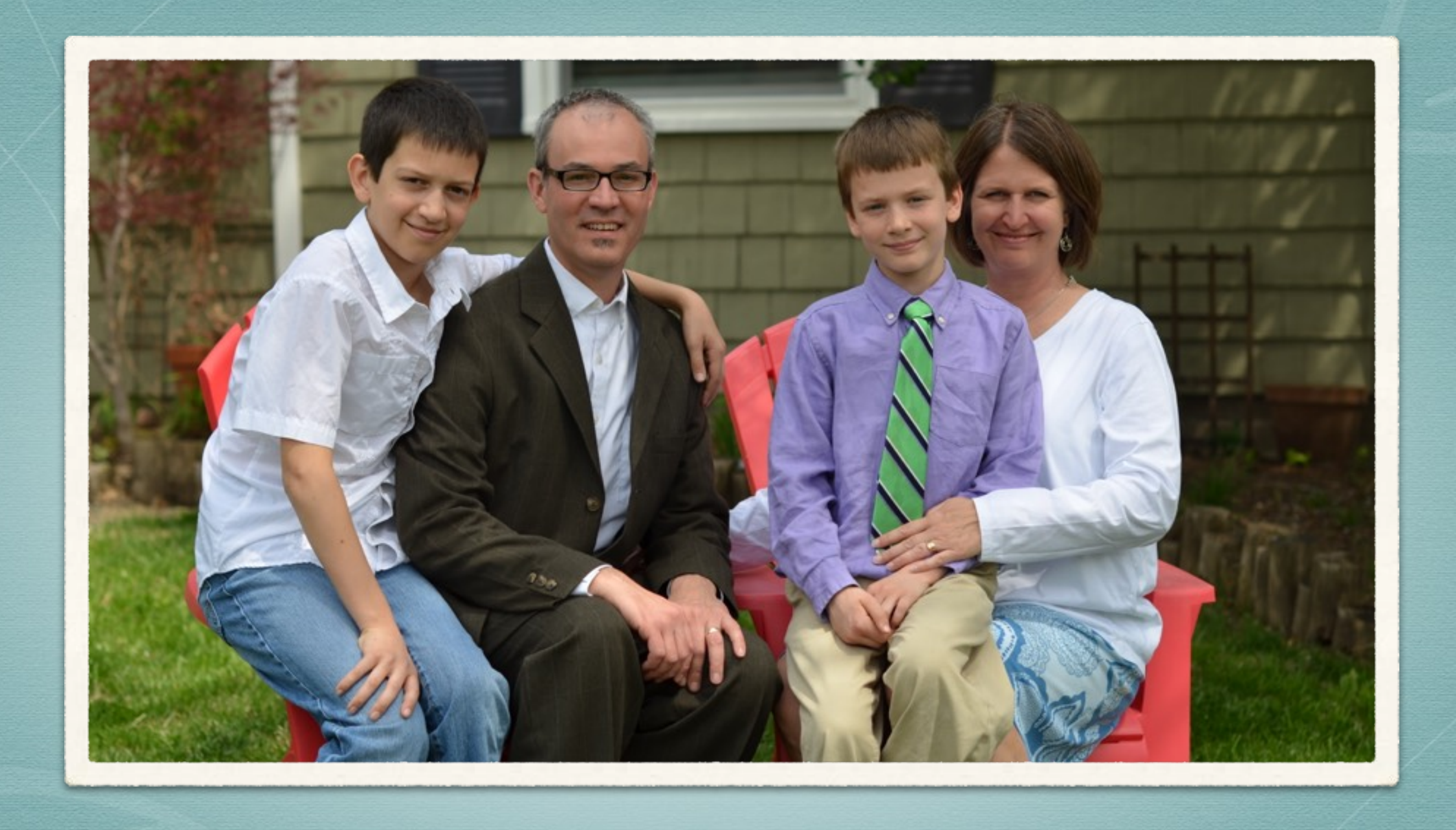
Thank you for the invitation to be here!