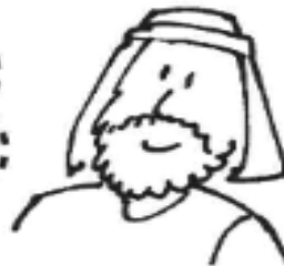
James, son of Alphaeus