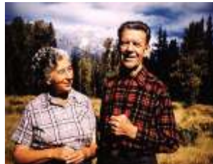
Marty and Olaus Murie

The Green Sanctuary Ministry Team's book club selection this year was "Two in the Far North" by Margaret E. Murie . "Mardy," as she was known, was raised in Fairbanks and then later in life followed her biologist husband to the far reaches of northern Alaska – the first time shortly after they were married in the 1920's – well before the invention of Polypropylene thermal underwear and Polartec fleece outerwear: