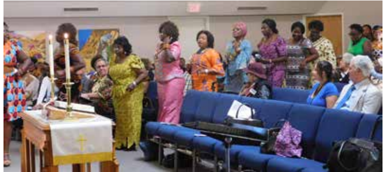
Cameroon women's chorus processed into the sanctuary singing.