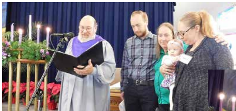
December 11 • The Elliot Family