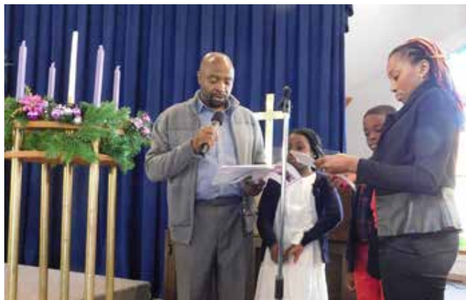
November 27 • The Ngwa Family