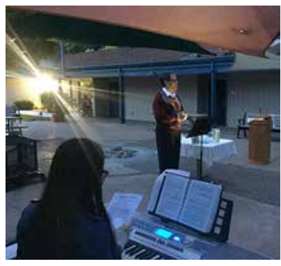
The Cameroon Choir on Palm Sunday.