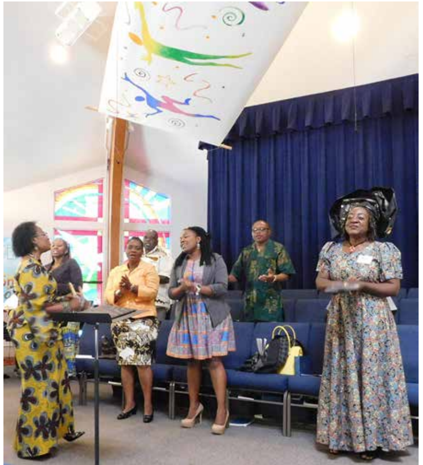
The Cameroon Choir