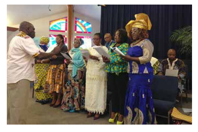
The second Sunday of every month, we are blessed to have the Cameroon Choir sing. In November, they provided the Introit "O Day of Rest and Gladness;" the Offertory "Ba Ni Ngeti Ba Yaweh;" and the Anthem "We Plough the Fields and Scatter the Good Seed on the Land."