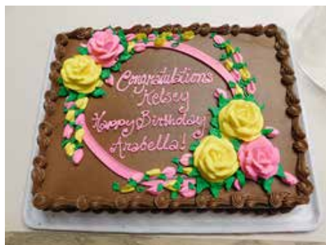
There was celebratory cake!