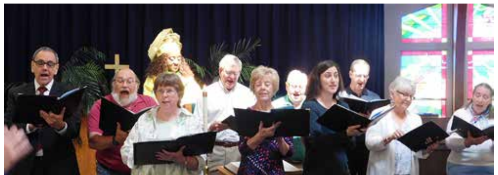
The STHPC Choir.