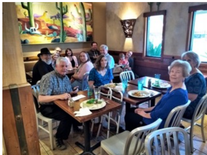
The last Sunday of every month we gather for brunch at AQUI. Join us!