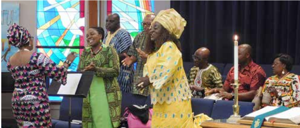
The Cameroon Choir