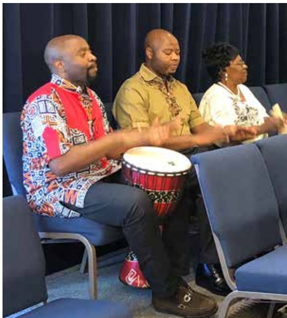
We don't usually get to see the percussionists because they usually sit in the last row.