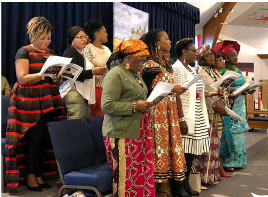
Our lively and spiritual brothers and sisters of the Cameroon Choir.