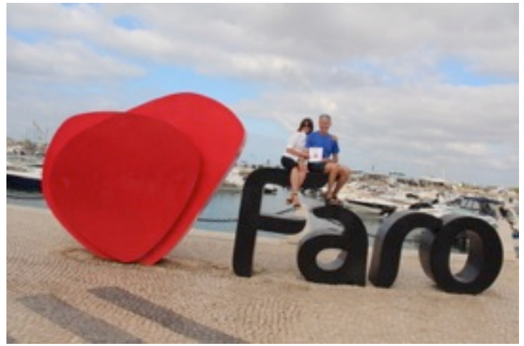
In Faro, on the southern coast of Portugal