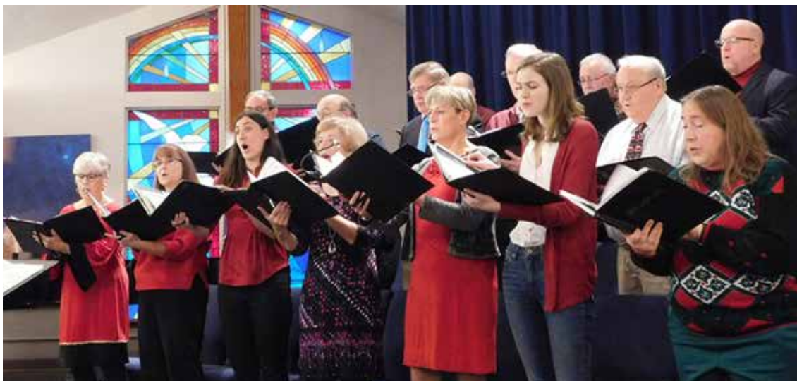
Members of the a capella group Crescendo joined STHPC’s Chancel Choir for some very memorable and moving musical pieces.