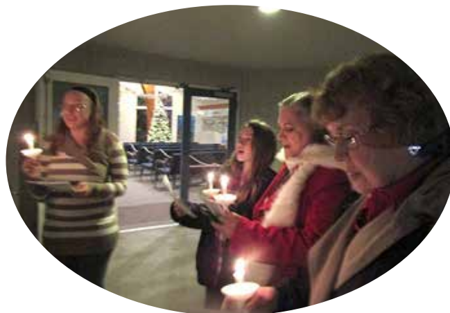
The rain could not stop our 18 attendees at the 11:00 p.m. Candlelight Service in singing "Oh, Holy Night" in the courtyard.