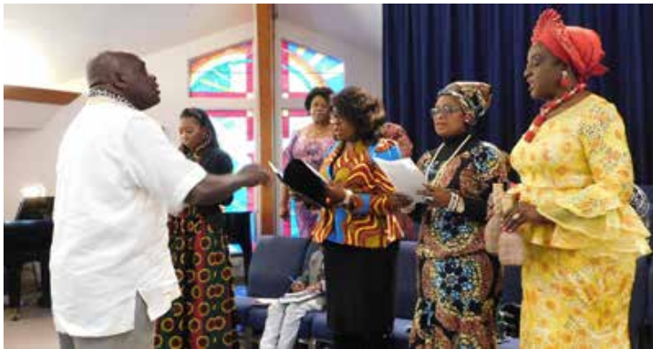
The Cameroon Choir