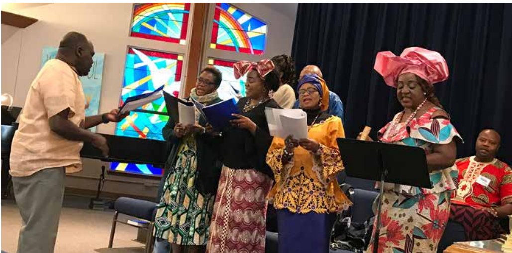
On February 10, our Cameroon brothers and sisters had us movin' and groovin' as they presented the Introit "All to Jesus I Surrender," the Offertory "Let Us Rejoice in the Lord Jesus," and the Anthem "When Jesus Calls Me, I Will Answer."