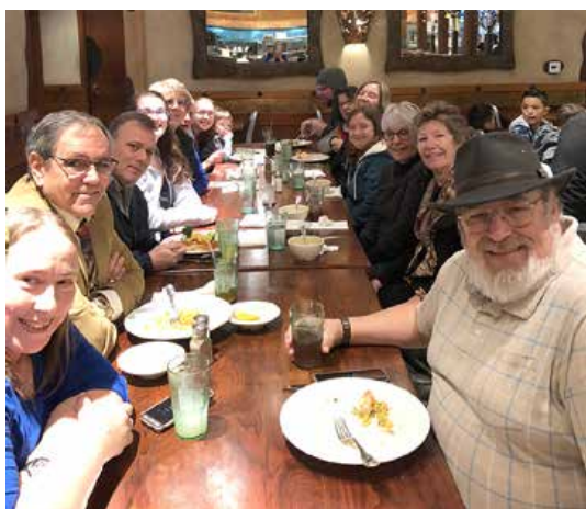
The gang's all here! On Sunday, January 13, a bunch of us met at our local Aqui and had a great time together over delicious foodies.