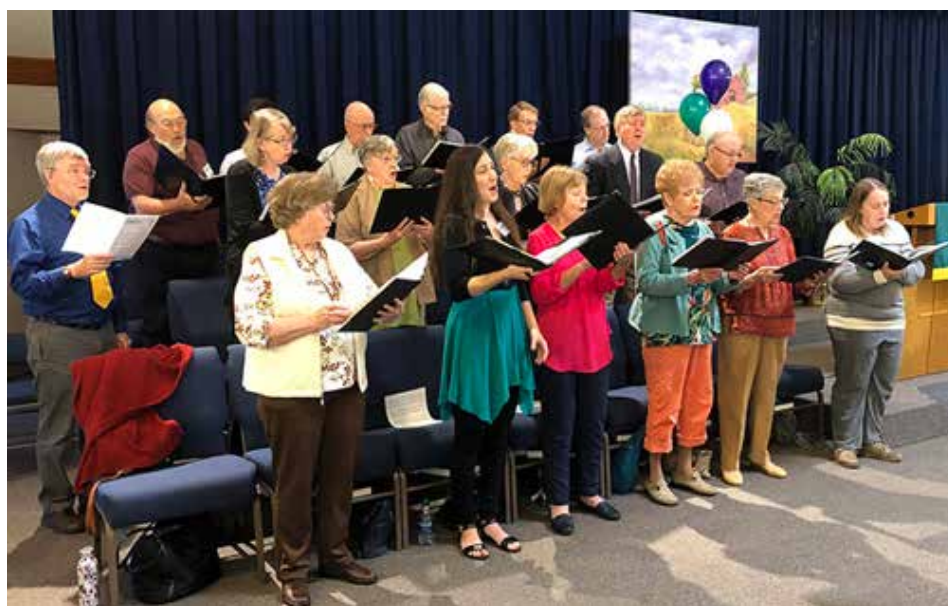
Trinity Presbyterian Church and STHPC Chancel Choir