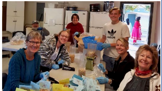
PW nut packing Nov. 2