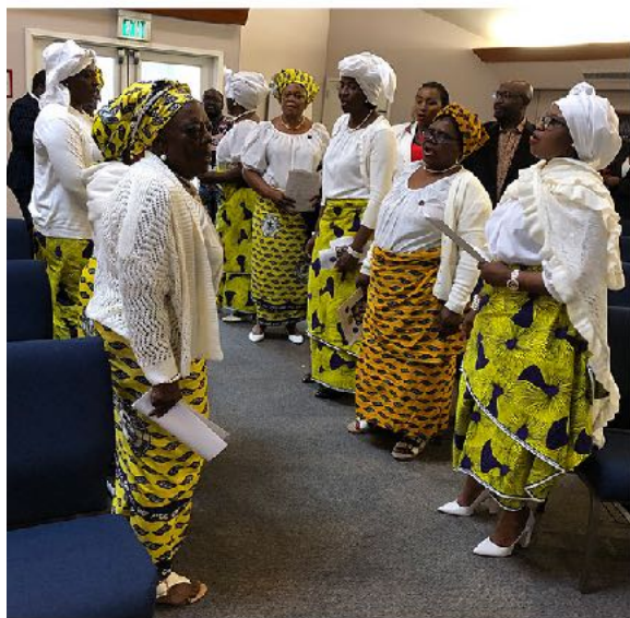
Gilroy Presbyterian Church and STHPC Cameroon Choirs process in.

With the sanctuary filled to capacity, parishioners from all over the Bay Area enjoyed the first annual Christmas Day Service sponsored by the Northern California Christian Women Fellowship. A Cameroon feast and lively conversation followed in the Fellowship Hall.