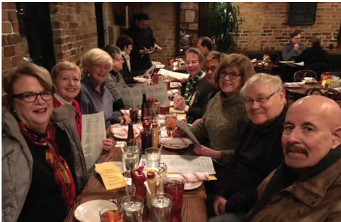
The Flying Solo group enjoys dining out at Chadwick's in Old Town in January.