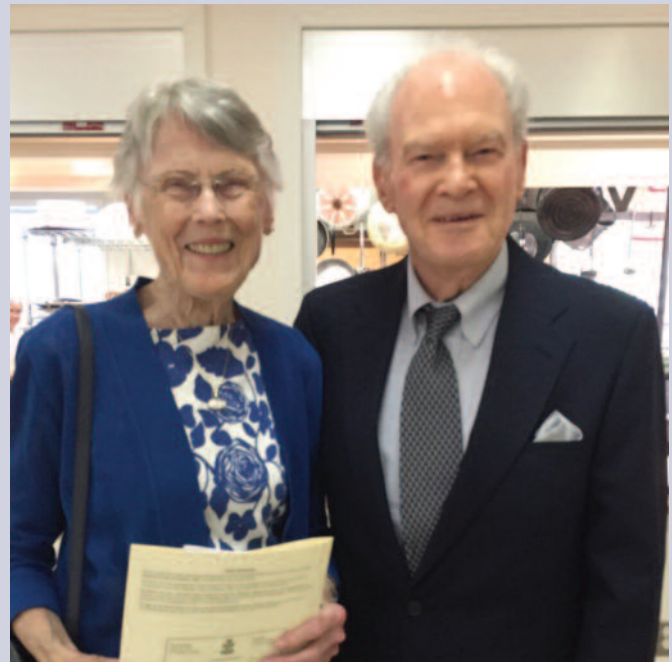
Some smiling faces on Easter morning!