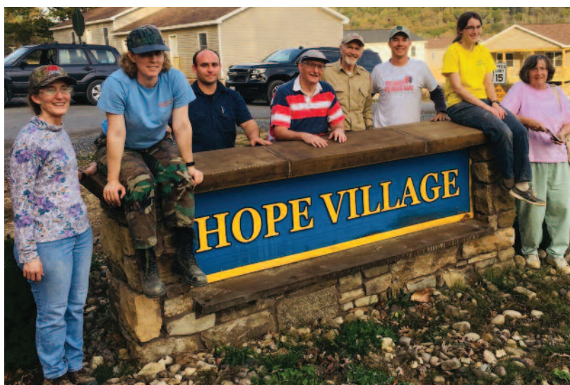
Here are some of our WPC team members after finishing up their work during last October's ASP trip to West Virginia.

Individuals of all construction skill levels are encouraged to learn about Westminster's October mission trip to Guyan Valley, West Virginia, where we will help ASP provide safe homes for vulnerable residents in the region. The trip will take place from Thursday, October 25–Sunday, October 28. Please contact nationalmission@wpc-alex.org with questions and /or interest!