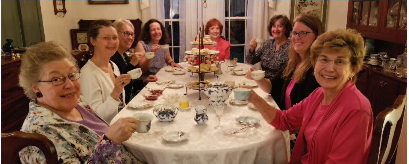
The PW Coordinating Team enjoyed an end-of-year tea in June!