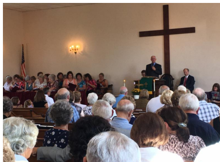
A filled sanctuary on Sept. 17, 2017

Today, this small, faithful congregation continues to be active in worship, education and service to the Bloomingburg community. Food or money is collected each month to donate to a variety of special needs in the area.