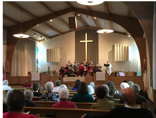
Eastminster and Brookwood share worship on East Broad Street on February 11

five years of Eastminster's faithful ministry and mission at Eastminster's current location on East Broad Street. Following Eastminster's final service at this Broad St. location on Easter Sunday, April 1, the Eastminster