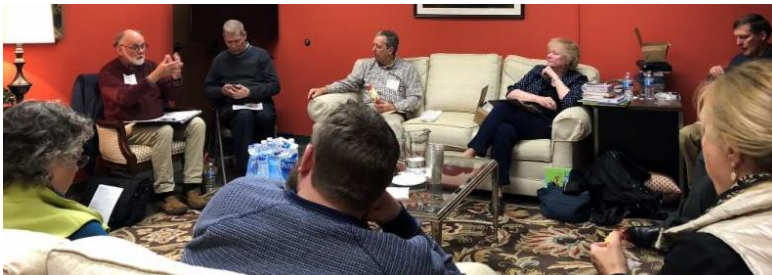
Global Missions Network Meeting in Worthington

If so, plans are unfolding for a new "PSV Global Missions Network" of representatives from all congregations in our presbytery that wish to support, encourage, and inform one another about opportunities and healthy models of mission involvement.