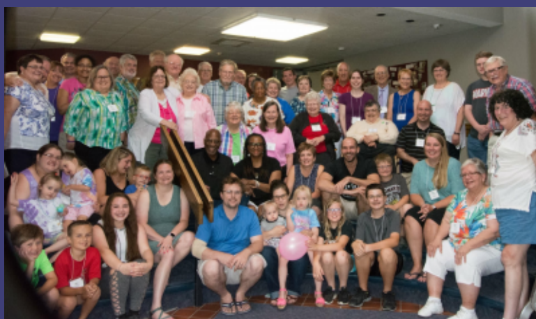
2018 Covenant Gathering "Rooted and Grounded in Love"