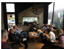
Clintonville Rusty Bucket