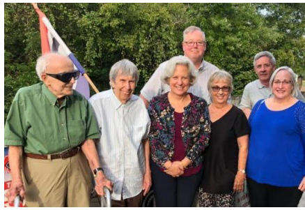
Athens and Southern Ohio Area Pastors, Spouses and Friends

2-4 pm Mifflin Presbyterian Church, Gahanna