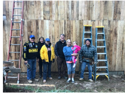
Mission team celebrating completed work with residents.

Camps (WVMAW) site coordinator. The Scioto Valley team, divided into 3 groups and 3 house renovation projects, worked on winterizing mobile homes and building decks and stairs to assist residents with special needs or challenges. The mission team members gathered every evening for fellowship, delicious home-cooked meals and devotions.