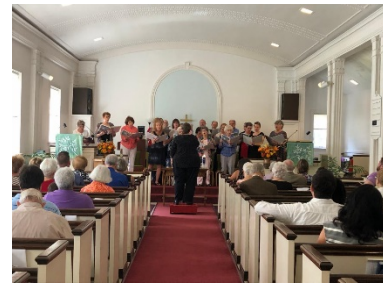
Eastminster's Final Worship Sunday, August 25