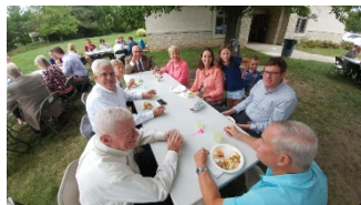
Worship and Fellowship in the Church Yard