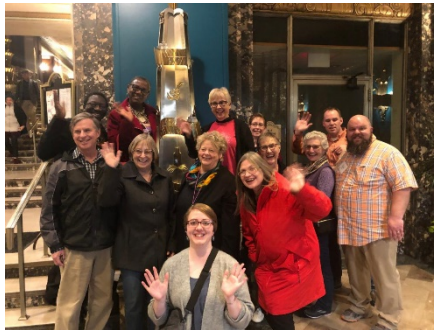
Scioto Valley Presbyterians Enjoy Fellowship at Next Church

Gathers Presbyterians from Across the Denomination