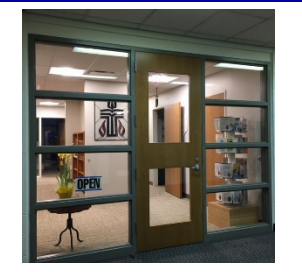
Presbytery Office Remains Closed...

Although the Presbytery Office is closed, the Presbytery staff persons continue to work remotely and separately. They are available and can be contacted through email or phone messages.