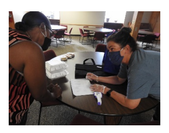
Serving the Community.