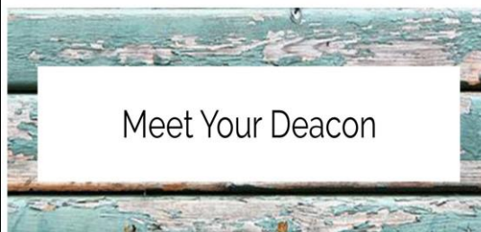
Meet Your Deacon

Sunday, Sept. 15 th , is the deacon's coffee hour. This is the perfect time to meet your deacon, touch base and visit a bit. With luck, a tasty treat or two will also be available.