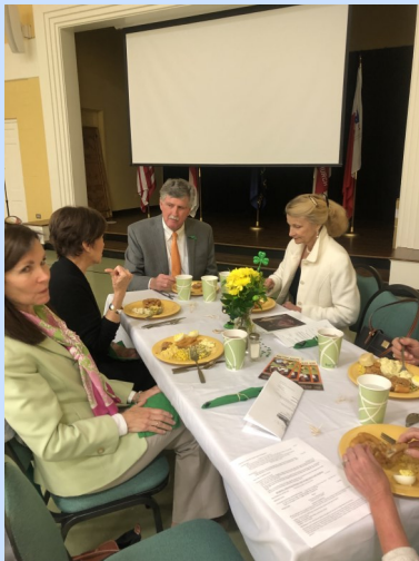
AGAPE VILLAGE foundation