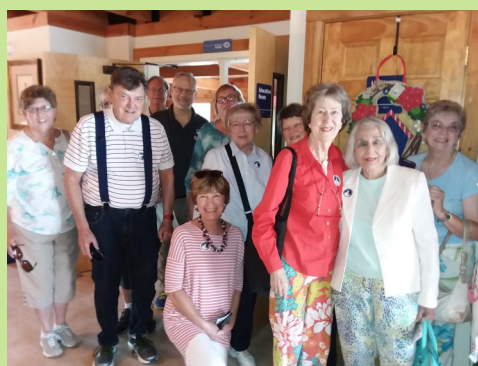
Outing to Sylvan Heights Waterfowl Park and The Hen and the Hog on June 12