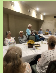
PW Officer Installation at the Birthday Brunch on May 21, 2019