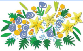
Flowers for the Sanctuary

Honor someone or mark a special occasion in the coming year by signing up by the date you prefer on the flower chart that is posted on the bulletin board outside the church office. Dionne Seale