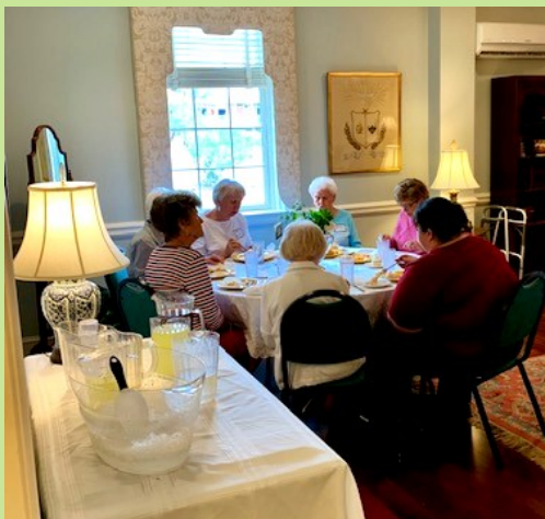
Lunch Bunch (9/16/19)