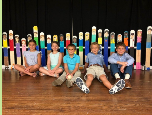
3rd Grade Bible recipients & Rally Day (9/8/19)