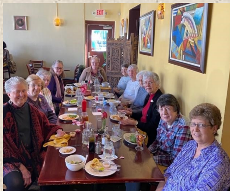
At left, Friday Friends gathered for lunch to celebrate February birthdays!