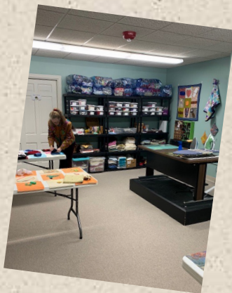
Above, Handcraft Ministry “elves” hard at work organizing their space!