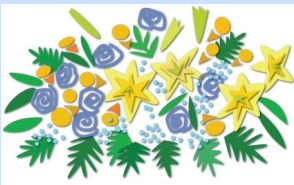
Flowers for the Sanctuary

Honor someone or mark a special occasion in the coming year by signing up by the date you prefer on the flower chart that is posted on the bulletin board outside the church office. Dionne Seale