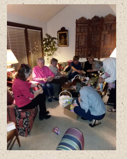
Above, Circle of Friends collected pillow cases for the Bassett Center and assembled collected bingo prizes for Covenant Homes. Items were give to the residents as Easter gifts!

Above left, Circle of JOY collected bingo prizes for Covenant Homes. At right, they donated $100 towards the Peacemakers Golf Tournament Fundraiser.