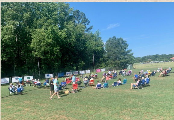
A beautiful outdoor worship service was held June 14, 2020 on the soccer field at Rocky Mount Academy.

Join us in hoping for beautiful weather and praying for the amazing candidate who is so very excited about serving God and our church. Don't forget to bring your own bread & juice for communion. Masks will be required.