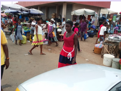
Above, outdoor shopping in Ghana