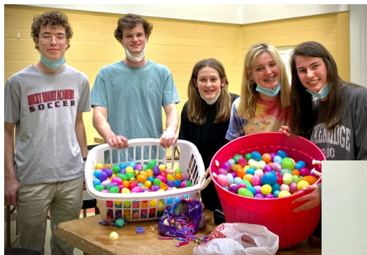
Above, High School youth helped stuff Easter Eggs for the big egg hunt on March 27!

Below— a few of our wonderful Confirmants!